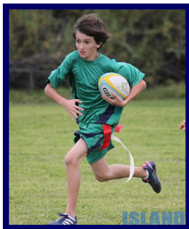
Primary Boys and Girls Tag Rugby Congratulations and a BIG THANKS to the coaches!

Parade Team - friends and family to be a part of the parade (we will have staggered blocked times this year so you don't have to do the entire route).